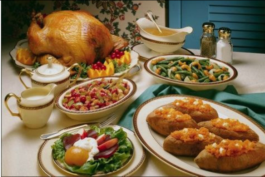
A traditional Thanksgiving Meal (consisting of a roasted stuffed turkey, cranberry sauce, cornbread, vegetables, pumpkin pie, sweet and roasted potatoes, etc.).